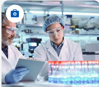
Healthcare & Life Sciences