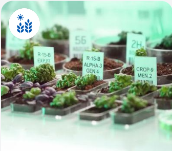
Agribusiness & Agriscience