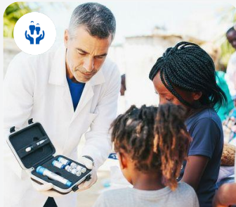
NGO & Not For Profit