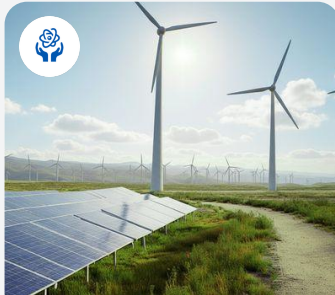
Energy, Natural Resources & Infrastructure