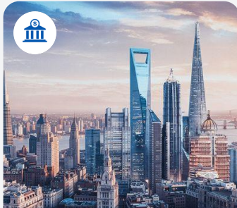
Banking & Financial Services