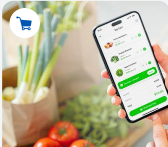
Consumer & Retail