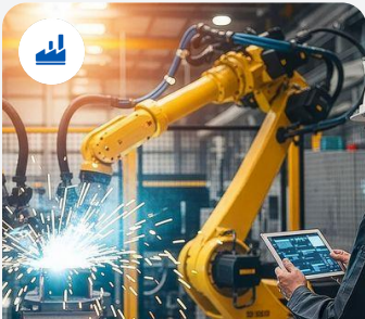
Industrial / Production